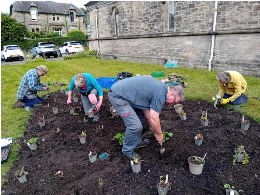
All working hard!